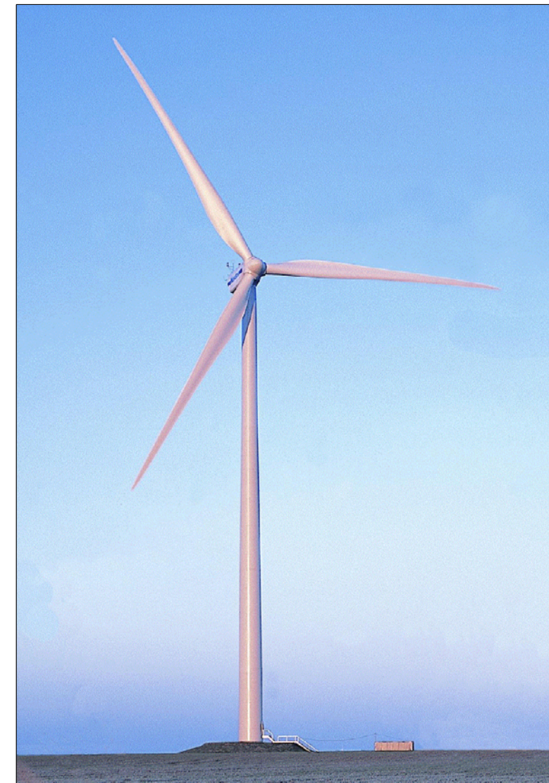
PHOTOGRAPH OF TYPICAL TURBINE